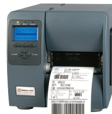
M-Class Mark II