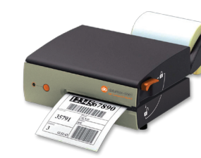
MP Compact4 Mark II