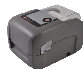
E-Class Mark III